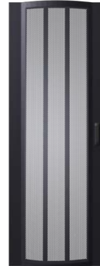
Single Curved Perforated Door