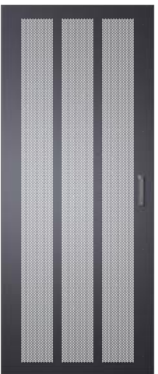
Single Perforated Door