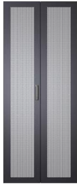
Double Perforated Door