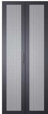
Double Perforated Door