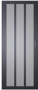
Single Perforated Door