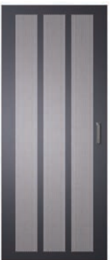
Single Perforated Door