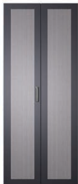
Double Perforated Door