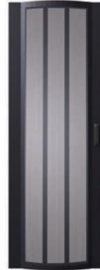
Single Curved Perforated Door