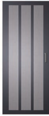
Single Perforated Door